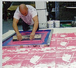
Collectors Contemporary: Pop culture icons portrayed afresh in 'Dirty Pretty Things'. See Galleries.