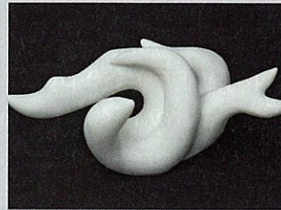
The Luxe Art Museum: Han Sai Por makes organic forms that represent our ever-changing landscape and the horrors that it tolerates. See Galleries.