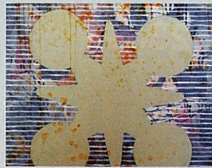
Utterly Art: Get lost in nostalgia, technology and social commentary in 'Mixed Signals'. See Galleries.