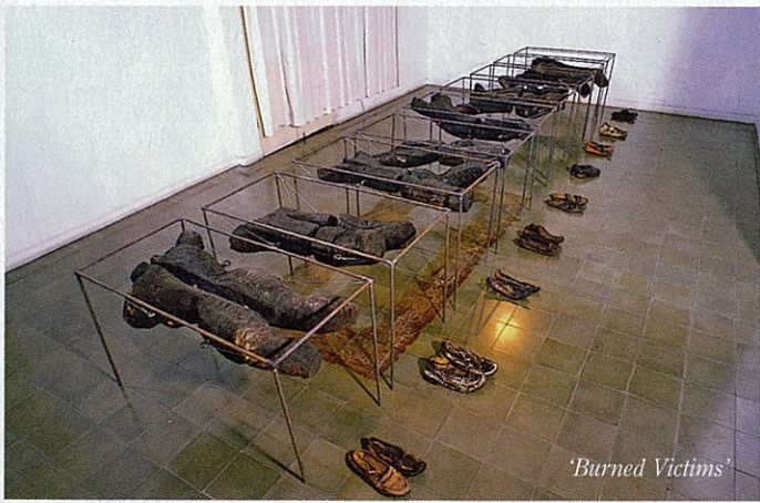
The history man Harsono's work bears witness to Indonesia's political upheavals