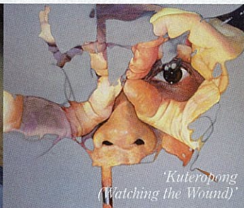
'Kuleropong (Watching the Wound)'