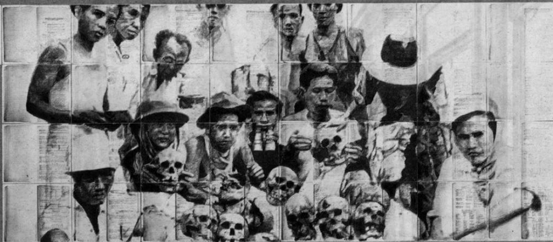
Indonesian veteran artist FX Harsono's Memorandum Of Inhumane Act No 3 , which is on show at A+ Works of Art gallery in KL.